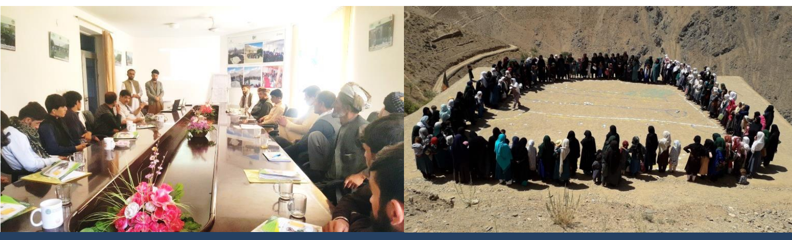
The hygiene behavior change workshop being conducted in "Shakar Lab" community in Yaftal Payeen district of Badakhshan province

For details, please refer to (Annex I) at the end of the report.