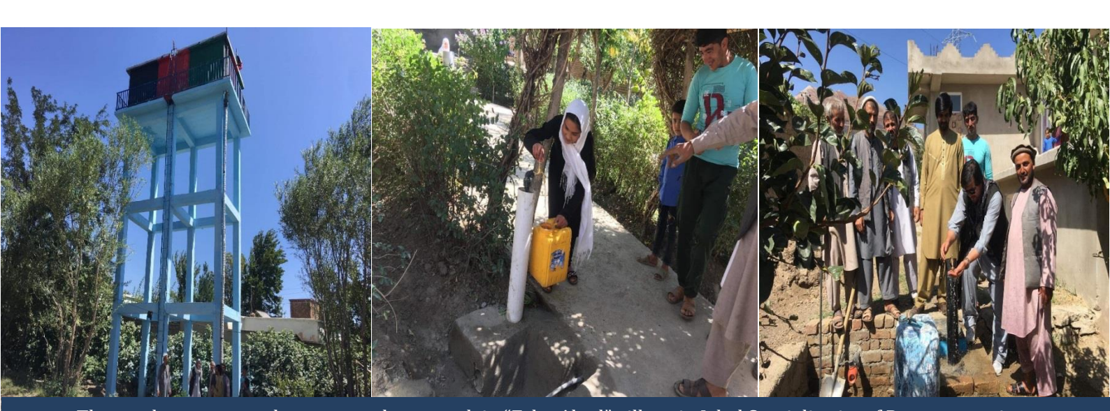
The newly-constructed water supply network in "Eshq Abad" village in Jabal Seraj district of Parwan province

The total cost of these three water supply projects is 12,2657 USD, which was funded by MoF through the State budget. The construction affairs of these projects created as many as 816 working days, and with the completion of these projects, around 669 families got access to clean drinking water in the mentioned provinces.