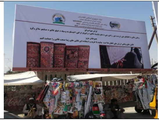
ghlan Billboard installed in Jalalabad City, Nangarhar